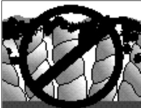
ALL SYNTHETIC NO STICKY RESIDUE