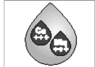
HARD WATER TOLERANT