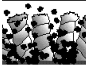
PENETRATES, LIFTS REMOVES HEAVY SOIL