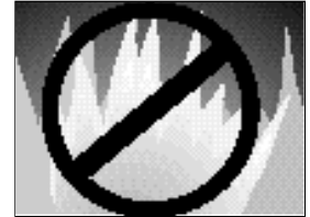
NON FLAMMABLE AND SAFE TO USE