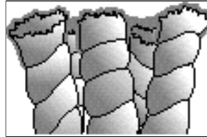
SEALS AGAINST SOIL & STAINS