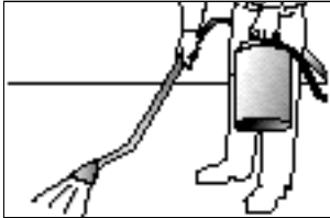
EASY SPRAY ON APPLICATION