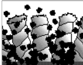
QUICK ACTING ON GREASY SOIL