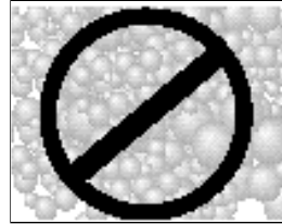
PROTECTS MOTORS FROM DAMAGE BY FOAM