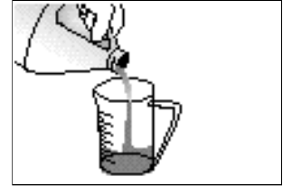
USE ONLY 1 OR 2 OZ. PER GAL. CAPACITY OF TANK