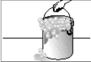
SAVES UNNECESSARY DUMPING OF FOAM