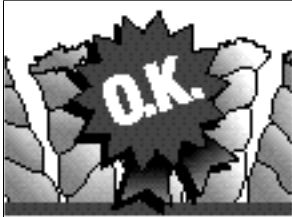
MEETS SPECS FOR 5TH GENERATION NYLON