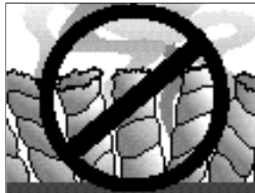
CONTAINS A PROVEN ODOR COUNTERACTANT