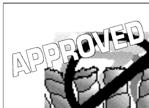
RECOMMENDED FOR ALL TYPE CARPET