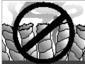
WORKS IMMEDIATELY TO ERASE ODORS