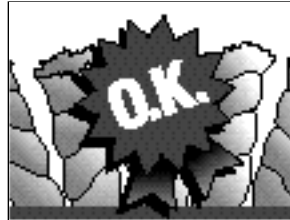
SAFE FOR PERSONNEL AND ON SURFACES