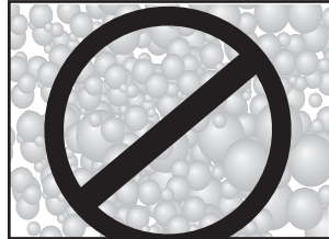
PROTECTS MOTORS FROM DAMAGE BY FOAM