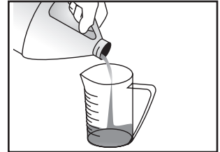
USE ONLY 1 OR 2 OZ. PER GAL. CAPACITY OF TANK